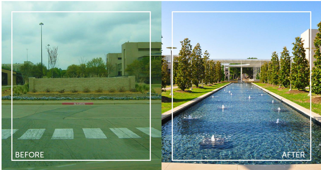
Figure.1 UT Dallas Campus Identity & Landscape Framework Plan, Before and After