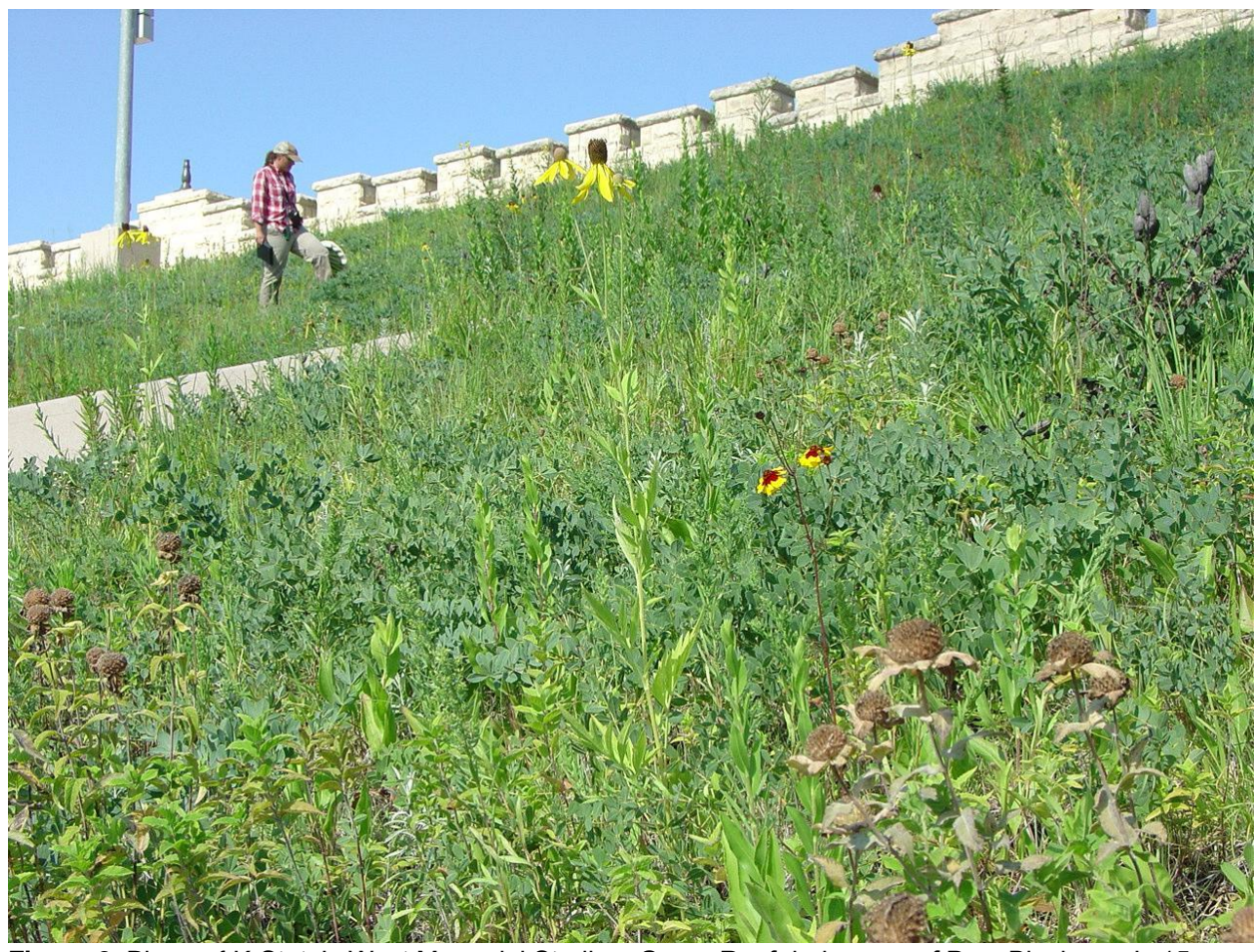
Figure 2. Photo of K-State's West Memorial Stadium Green Roof during one of Pam Blackmore's 15 butterfly walks.

5. Saves an estimated 16,932 kWh and 133.5 Therms or $1,425 annually in energy costs on each green roof as compared to a conventional dark roof, and 458.5 Therms or $90 annually compared to a white roof.