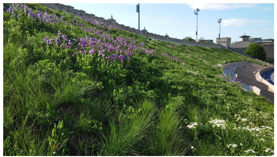
Figure 3. Photo of the West Memorial Stadium Green Roof May 29, 2020.