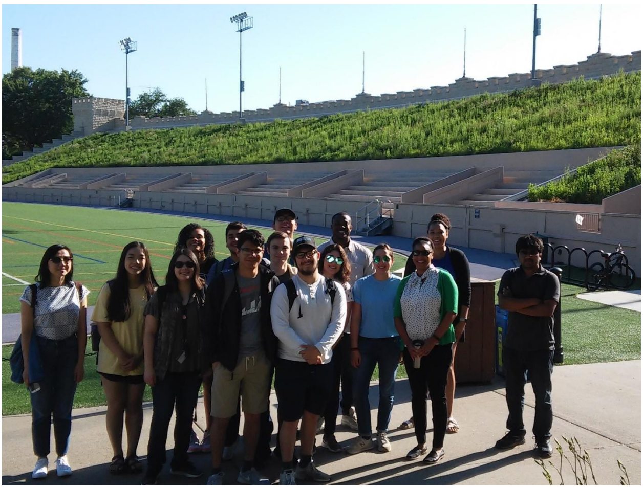
Figure 8. Photo of the East Memorial Stadium Green Roof June 13, 2019 during an educational event where three green roof researchers shared observations with a group of scholars visiting the K-State campus to learn the purpose of the two green roof and about our ongoing plant, pollinator, and soil moisture monitoring, our multi-year green roof maintenance observations, and our regular vegetation management efforts.