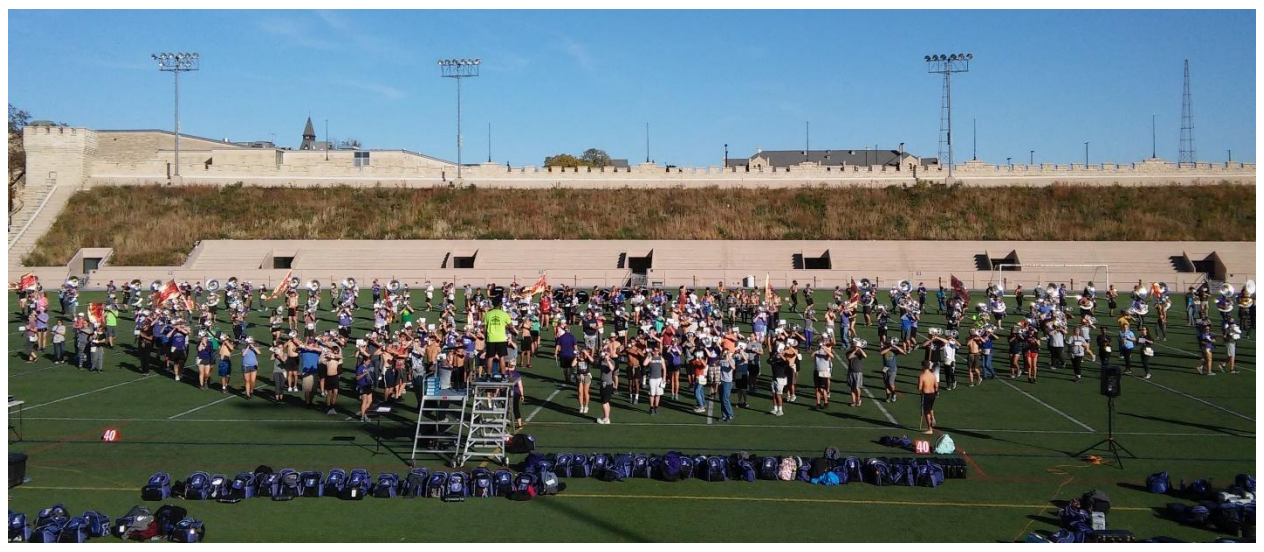
Figure 7. Photo of K-State's East Memorial Stadium Green Roof as a backdrop to a K-State Band practice. Photo taken by Lee R. Skabelund on October 23, 2018.

Note: Per Dr. Trancz (K-State Band Director), the two green roofs generally complement the use of the Memorial Stadium by members of the band (see Fig. 7): "The green roofs look very nice. As a gardener, I enjoy them—and am impressed at the plant growth on the steep slopes. We must dodge or fight bees at times. It is soothing to watch & hear the sprinklers."