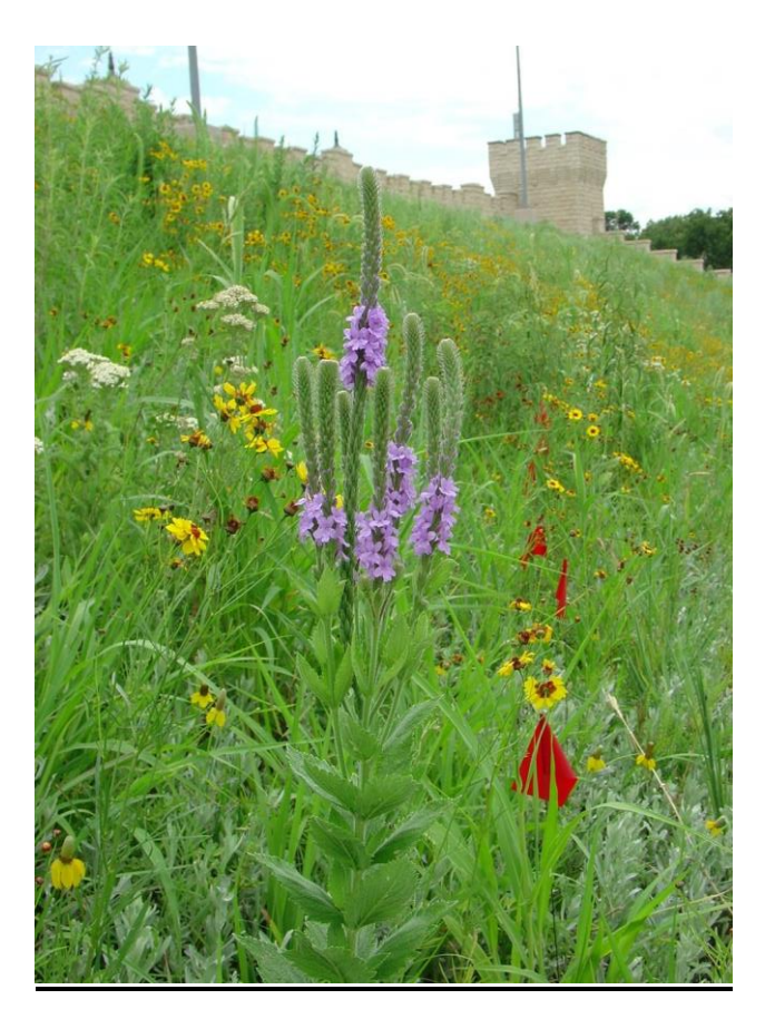
Figure 4. Photo of the East Memorial Stadium Green Roof June 30, 2016 during initial plant species identification and species dominance research (thus the red flags spaced every two feet apart).