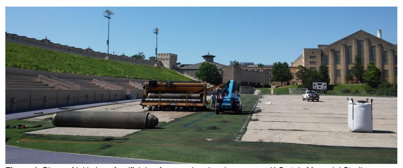
Figure 1. Photo of initiation of artificial turf removal and replacement at K-State's Memorial Stadium (unexpected by the K-State LAF-CSI research team). Photo by Lee R. Skabelund; June 12, 2020.

K-State took advantage of having very few people on campus and in the local community by closing Memorial Stadium during a portion of the summer of 2020. This allowed K-State to have a contractor replace the artificial turf on the playfield inside the running track at the Memorial Stadium (see Figure 1). As a result, there were very few people visiting the stadium and associated green roofs from mid-June through late July 2020. Research regarding the use of the Memorial Stadium in spring and summer 2020 by K-State students and visitors was thus severely hampered by the community and campus response to COVID-19.