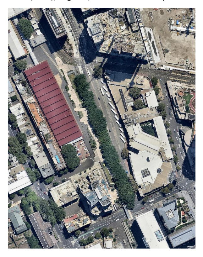
FIGURE 3: The Goods Line (North), February 11, 2017 after redevelopment.