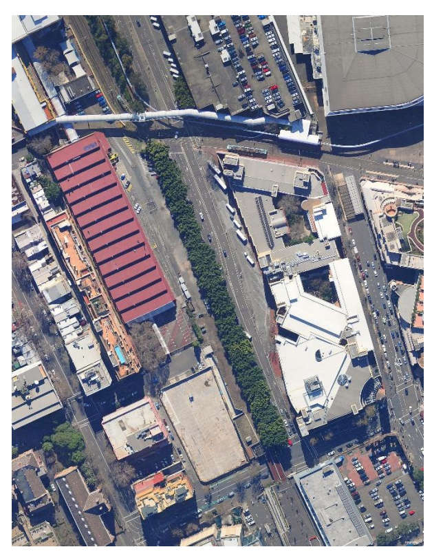
FIGURE 2: The Goods Line (North), August 1, 2010 before redevelopment.