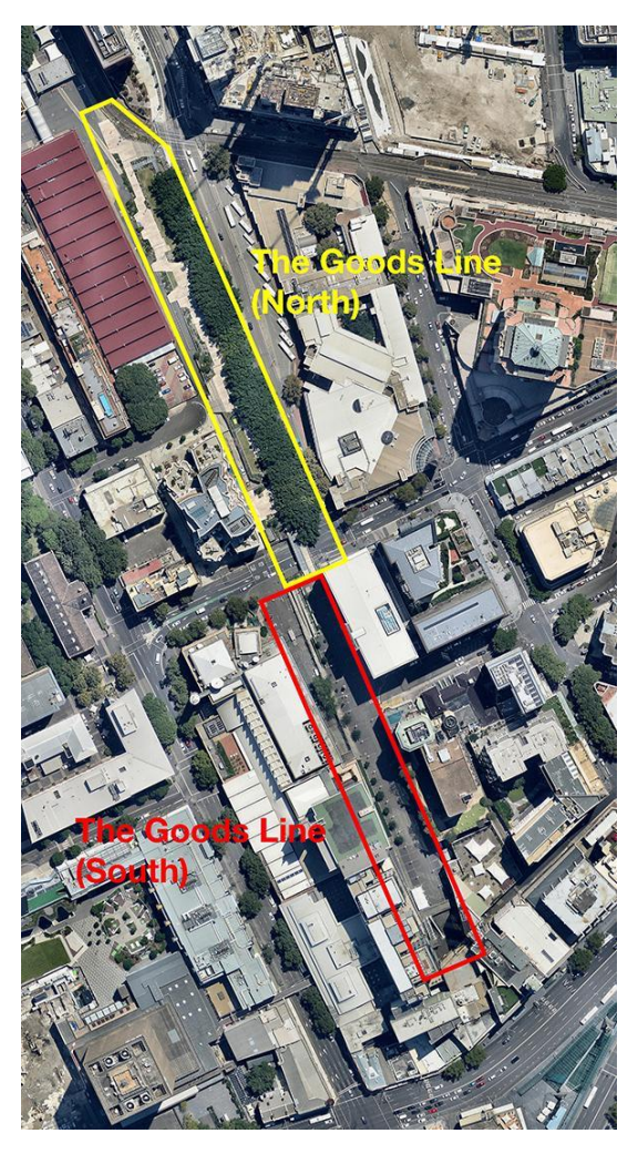
FIGURE 1: Relationship between The Goods Line (North) (the principal study area for this case study) and The Goods Line (South).

The Goods Line project that is the subject of this case study refers to the redevelopment in 2015 of an area of disused freight railway corridor running northeast from Sydney's Central Railway Station that once serviced the dockyards and warehouses of Pyrmont and Darling Harbour and the Ultimo Power Station. However, the area redeveloped in 2015 was only a section of the overall area referred to as "The Goods Line." The overall area is divided into two sections – The Goods Line (North), which is north of Ultimo Road, and The Goods Line (South), which is south of Ultimo road. The two sections are now connected to each other by the former railway bridge (known as Ultimo Bridge) over Ultimo Road. Strictly speaking, the 2015 redevelopment project designed by ASPECT Studios comprised only The Goods Line (North) and the bridge across Ultimo Road; The Goods Line (South) was originally redeveloped with fairly minimal landscape interventions and opened to the public in the 1990s, while Ultimo Bridge and The Goods Line (North) remained closed to the public until the 2015 redevelopment.